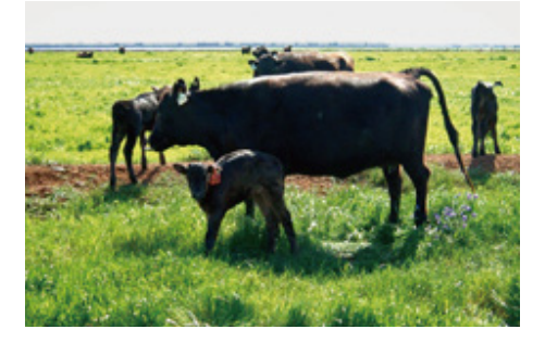
Living livestock: Australian beef cattle for fattening, beef cattle for breeding, milk cows for breeding, etc. Grass: North American and Australian grass and other feed materials, etc.