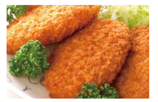
Croquettes, ground meat croquettes, roast pork, meat balls, kakiage mixed vegetable and seafood tempura, white fish fries, squid fries, kushikatsu skewered and fried meat and vegetables, takoyaki octopus balls, okonomiyaki Japanese savory pancakes, etc.